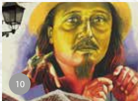
Teobaldo Power Street, 16

The main subject is a little puffin, a bird that lives on the cliffs of Vik, a small fishing village on the southern coast of Iceland. The artist wished to capture the connection and the adventure he himself experienced when he travelled to Puerto de la Cruz by crossing the Atlantic directly from Iceland. The mural depicts his own journey, and shows details of both fishing communities –brought together through the figure of the puffin lost along the coast of Puerto de la Cruz– which are bathed by the same ocean.