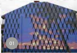
Mequinez Street, 2