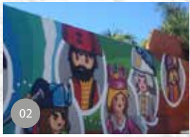
Mequinez Street, 4

His murals are classics that become indelibly stamped on the minds of passers-by. These works are immediate, a reflection of what is happening in society here and now. The author doesn't offer any answers or solutions but questions the prevailing status quo with a view to making passers-by think. This mural depicts a living mesh in which –because of economic factors and social prejudices– the gateway to Paradise is closed to part of humanity.