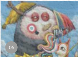
Peñita Street, 6

She is known in art circles for her extraordinary versatility and her passion for the realm of dreams. Her murals reveal a magic reality where the childhood attachment to the world of illusion still holds sway. Her work is also known for her personal expression of colours, textures and forms; her hyperrealistic dolls and her theatrical stage sets are famous.