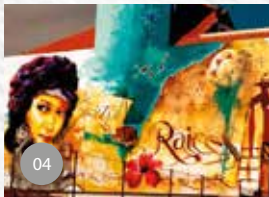
Mequinez Street, 66