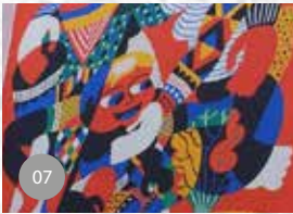
El Lomo Street, 28

Psychedelic surrealism, Pink Floyd and Dali are the inspiration for this piece, which depicts a person floating in space. His main motif is solidity and colour: he defines his work as an acid mix of pop elements where graphic design and illustration come together, explode and merge to produce murals that encapsulate his aesthetic concerns.